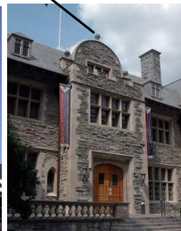
Houston Hall (north side)